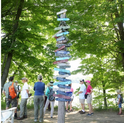
All Centred Outdoors Events